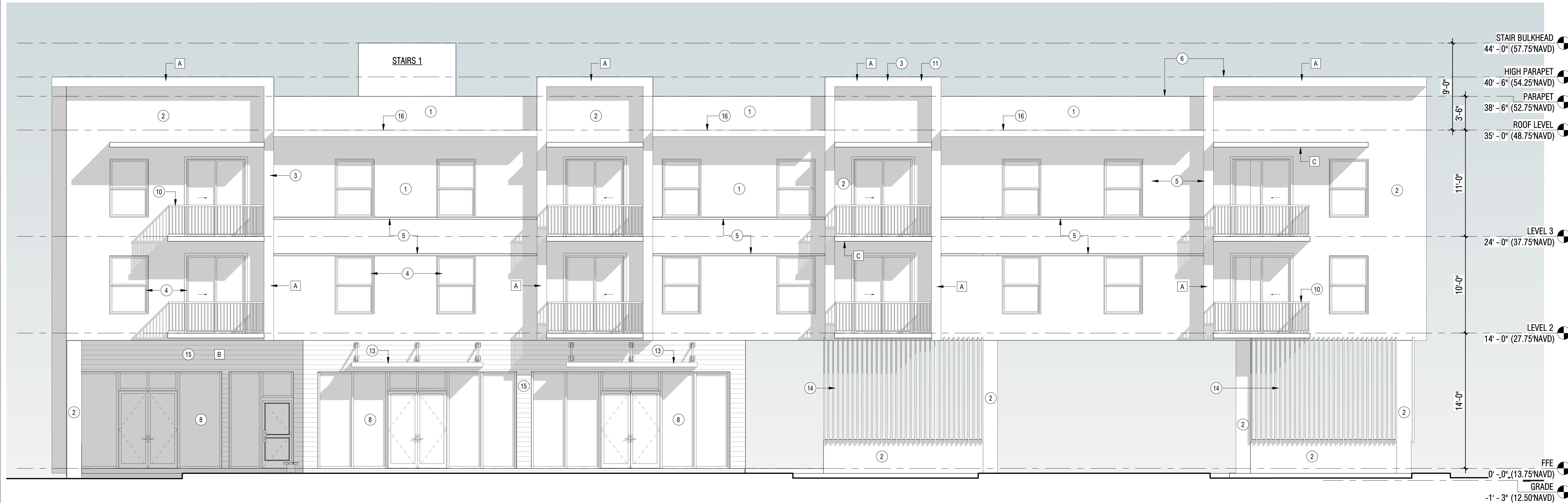
1 SOUTH ELEVATION (FRONTAGE) SCALE: 3/16" = 1'-0"